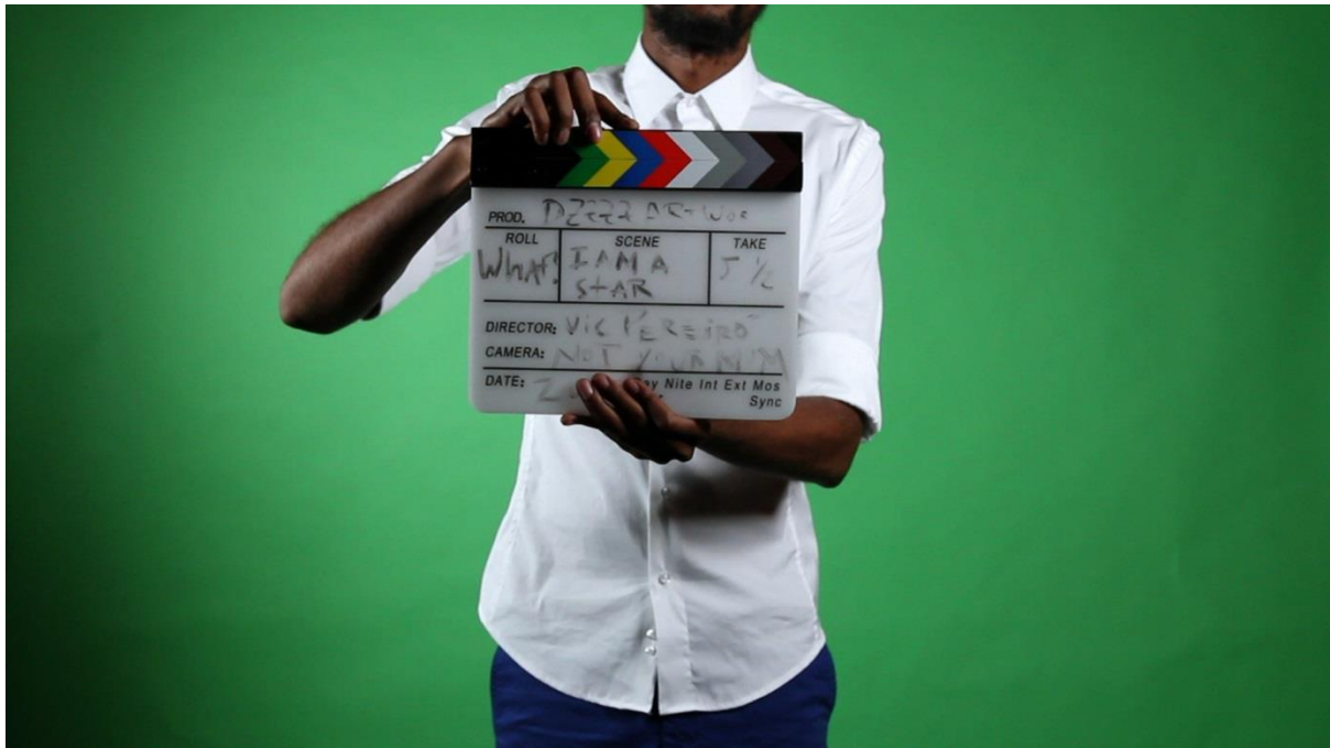
Nástio Mosquito (in collaboration with Vic Pereiró), Demo da Cracía , 2014, video. Courtesy Nástio Mosquito ©

Ikon and Nuova Icona are pleased to present an exhibition by Nástio Mosquito at the 56 th Biennale di Venezia, in the Oratorio di San Ludovico, Dorsoduro.